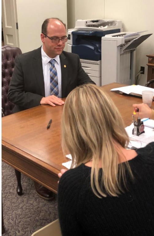
Introducing House Bill 4148