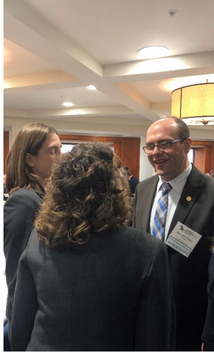
Speaking with Constituents

Tuesday, July 16 at 6 p.m. McCarty District Library 2071 S. Graham Road in Flint